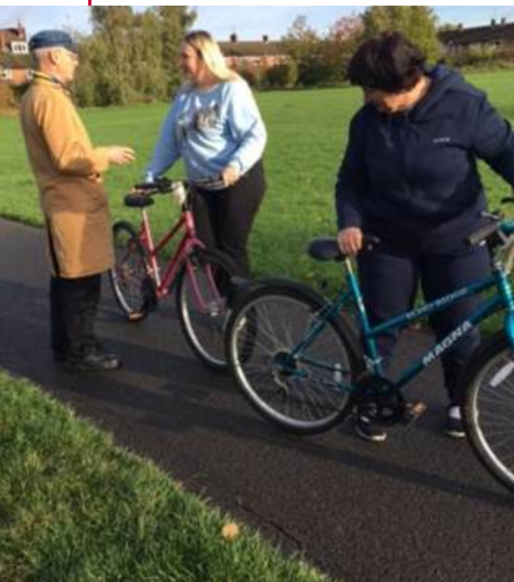
Pictured: Happy bike recipients

'I was very happy with my bike, it was much easier to get to school to pick up children! Thank you so much!'