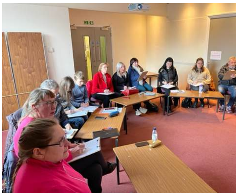
Pictured: English classes with Ukrainian refugees in the upper room of Wesley Methodist

'It is so extremely pleasant that there are people who are ready to greet you every Saturday with a homemade cake and a hot cup of tea. I feel like I come to see my dearest people, my family. Me and my kids are happy those moments.'