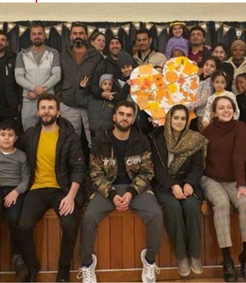
Pictured: St Vincent's Newcastle- Refugee families accessing grant funded ESOL classes and a space to cook.

The grant projects awarded reflect the ecumenical approach from applications. The grants provided an opportunity to equip a range of Christian projects who are mobilised to address the refugee crisis by their faith and increase capacity to meet the need of this community.