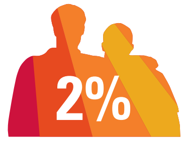
1 in 50 British adults say they used a food bank during 2016.