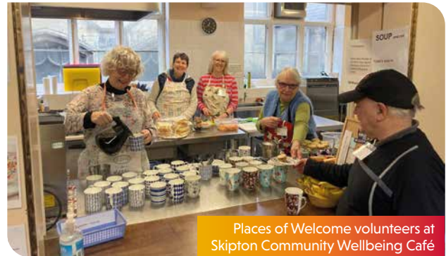
Places of Welcome volunteers at Skipton Community Wellbeing Café